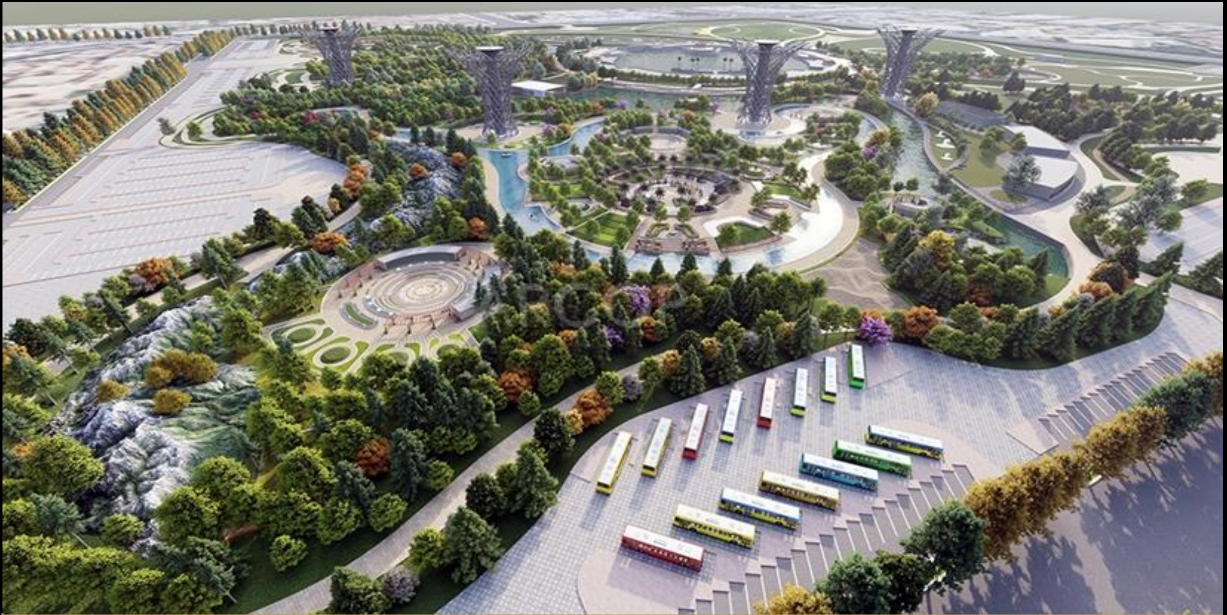
MINUTES AWAY FROM BHARAT VANDANA PARK, A 200 ACRE OASIS, SECTOR-20, DWARKA.