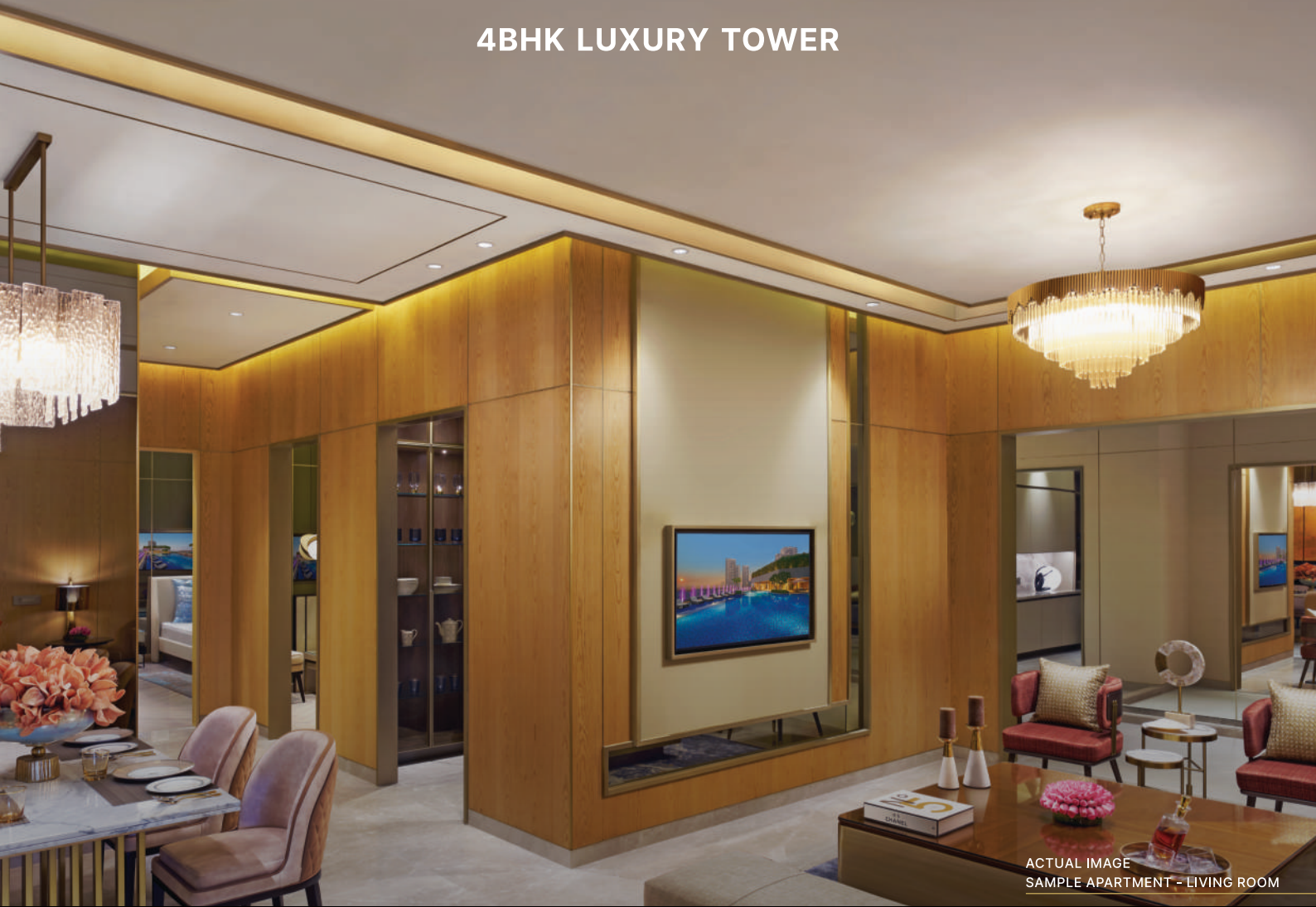
ACTUAL IMAGE SAMPLE APARTMENT - LIVING ROOM